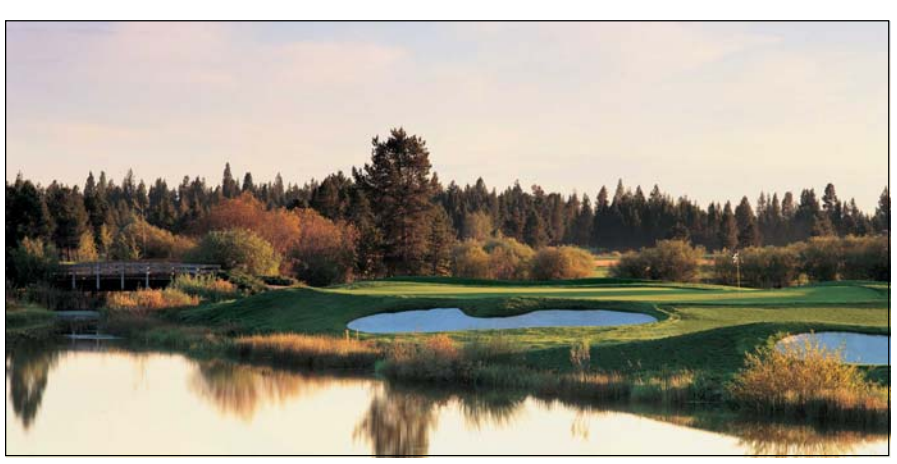
The Sunriver Resort offers a 15% discount at Woodlands, Meadows and Caldera Springs golf courses, and a $25 discount at the Sage Springs Club and Spa.

Gather some friends and rent a Resort house so you can cook and party together in the Village! Get your groceries on site at the Sunriver Country Store, a full service grocery store.